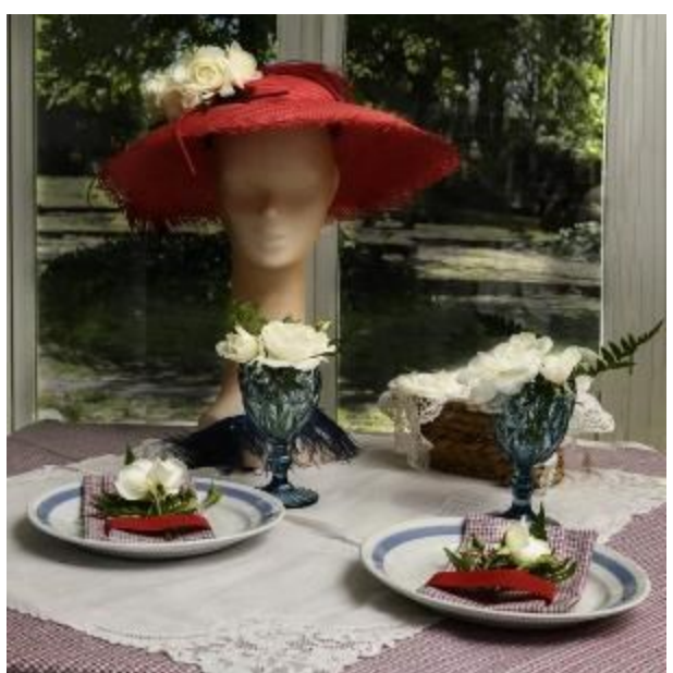
Left: Floral display Montevideo Rose Show, Middle and Right: Buenos Aries Rose Show

At the end of October, I visited the spring rose exhibition held in the Sivori Museum, in Buenos Aires, where many beautiful rose exhibits and arrangements were on show.