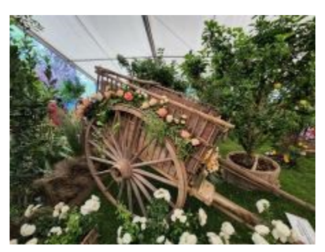
Concurs Internacional de Roses Noves Barcelona 2023 - Rose Festival at Sant Feliú de Llobregat

The Regional Heritage Rose convention held in Brussels during June was our next highlight. A delegation of several Uruguayans took part in this heritage rose event, which excelled from every point of view: lectures, gardens and rose collections, the christening of a new rose, and open air events in fabulous settings. On this occasion, I gave a lecture about Montevideo's 1912 Historic Rose Garden, the first one in South America, where I stressed its architectural and botanical importance.