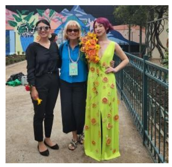
Above Left: Parque Araucano with the Andes Mountains in back, Middle: Poseidon & Roses, Right: Rose Fashion Below Left: More Rose Fashion, Middle & Right: Plant Sale at Parque Araucano