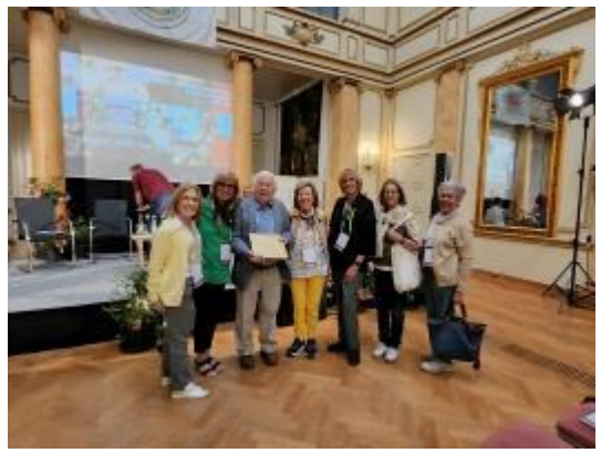
Uruguayan delegation at the Regional Heritage Rose Convention Brussels 2023

The Regional Heritage Rose convention held in Brussels during June was our next highlight. A delegation of several Uruguayans took part in this heritage rose event, which excelled from every point of view: lectures, gardens and rose collections, the christening of a new rose, and open air events in fabulous settings. On this occasion, I gave a lecture about Montevideo's 1912 Historic Rose Garden, the first one in South America, where I stressed its architectural and botanical importance.