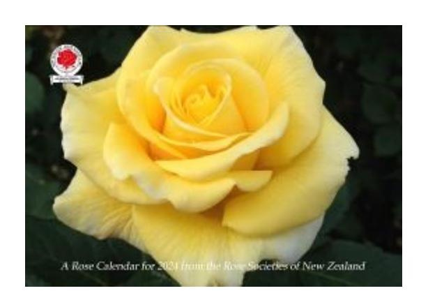
Left: NZRS Annual with 'Rebel Spirit', Middle NZRS Calendar with 'Gold Medal', Right: NZRS Rose Review with 'Spellbound'