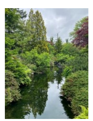
Left: Tokachi Millennium Forest, Middle: Rokka no Mori, Right: Manabe Garden