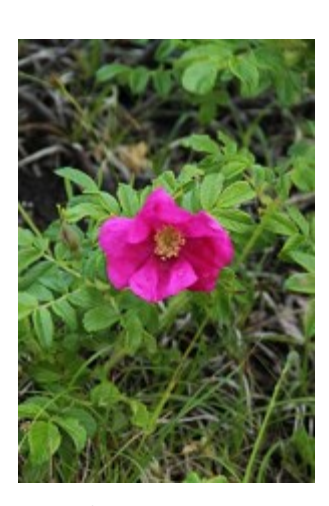
Left: Northern Horse Park Botanical Garden, Middle: Hamanasu-no-Oka Park, Right: Hamanasu (Rosa rugosa)

On the first day, we will stay in Sapporo, the capital city of Hokkaido. You will visit the "Ikor" forest, meaning "treasure" in Ainu language. At the next stop, the majestic natural surroundings of Hokkaido, you will enjoy interacting with horses at the Northern Horse Park theme park.