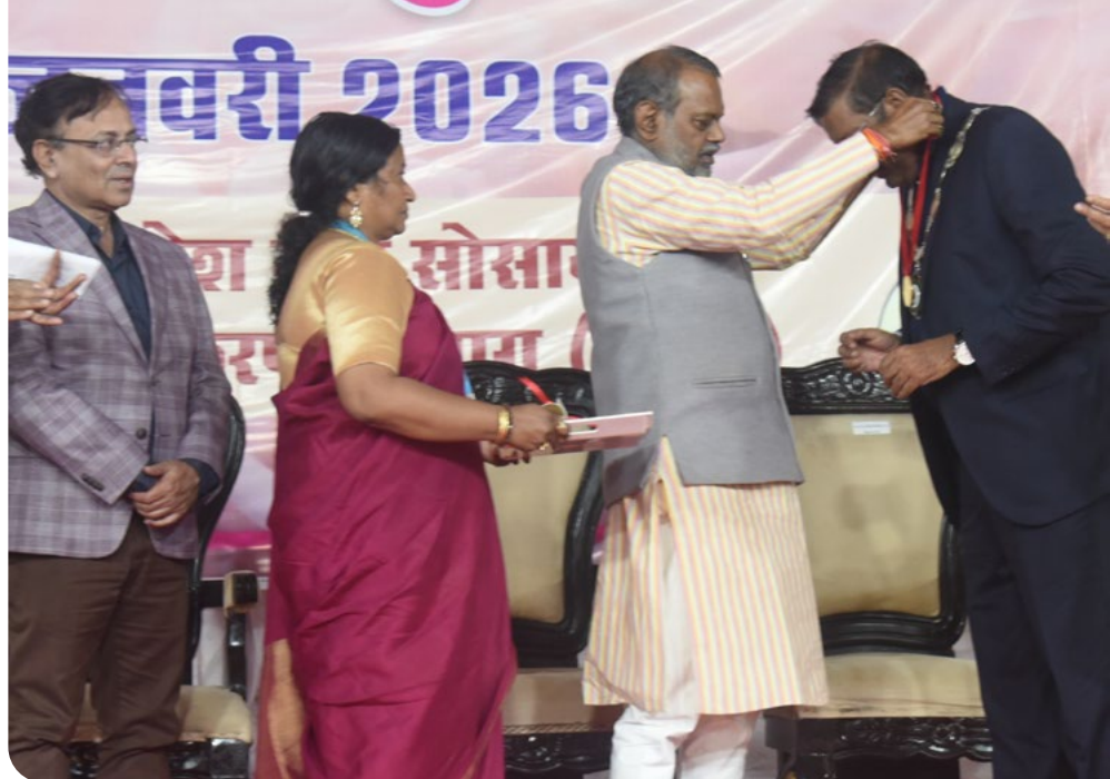
receiving the Gold Medal

Now it is the time to meet our Rose friends again. I am excited and eagerly looking forward to the WFRS Heritage