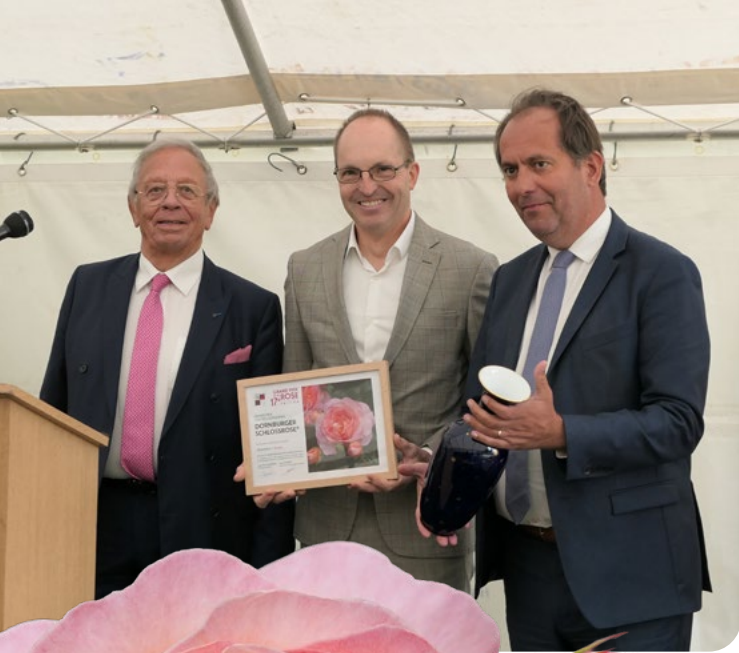
Grand-Prix de la Rose