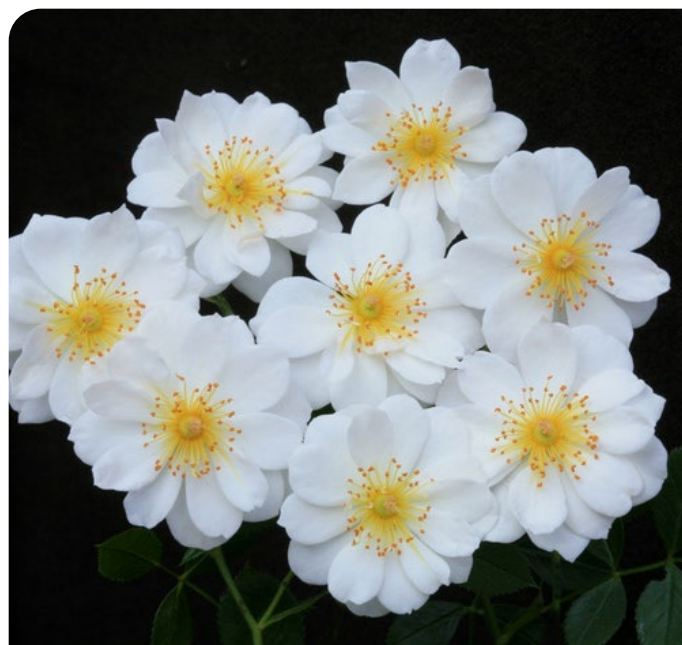
Winning photos from ARS Photography Contest: Best in Show - Miniflora "To Mummy"

The award-winning photos are presented each January in an ARS webinar. The webinar has been posted to the ARS website ( rose.org/member/resources/contests ) in case you want to watch it. On March 7th, the ARS has a webinar scheduled