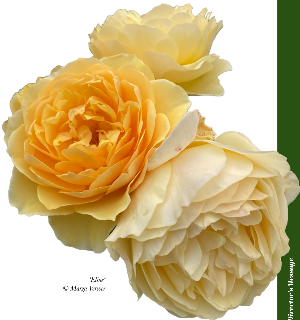
'Eline'

And today I do not limit myself to only administration, I keep my activities for the rose also outside an office, meet my rose contacts in person during events. This keeps me up to date, and friendship should be