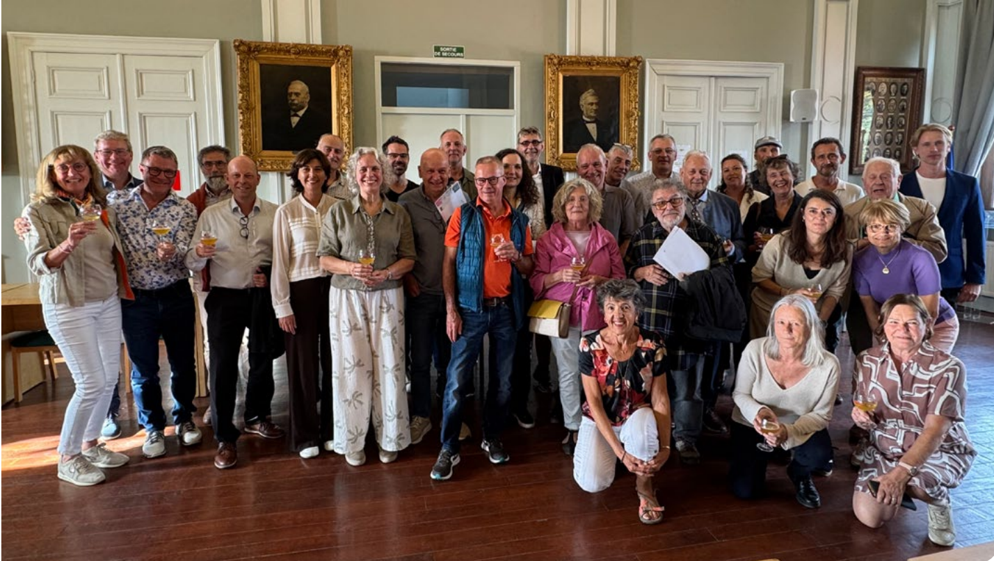
Combined meeting of the Rose Trials Committee and the Breeders' Club with the participants in Le Roeulx on 4 September 2025

BAGATELLE; The Netherlands THE HAGUE; Poland WARSAW; Belgium LE ROEULX and the last one for the season in Europe, France ORLEANS