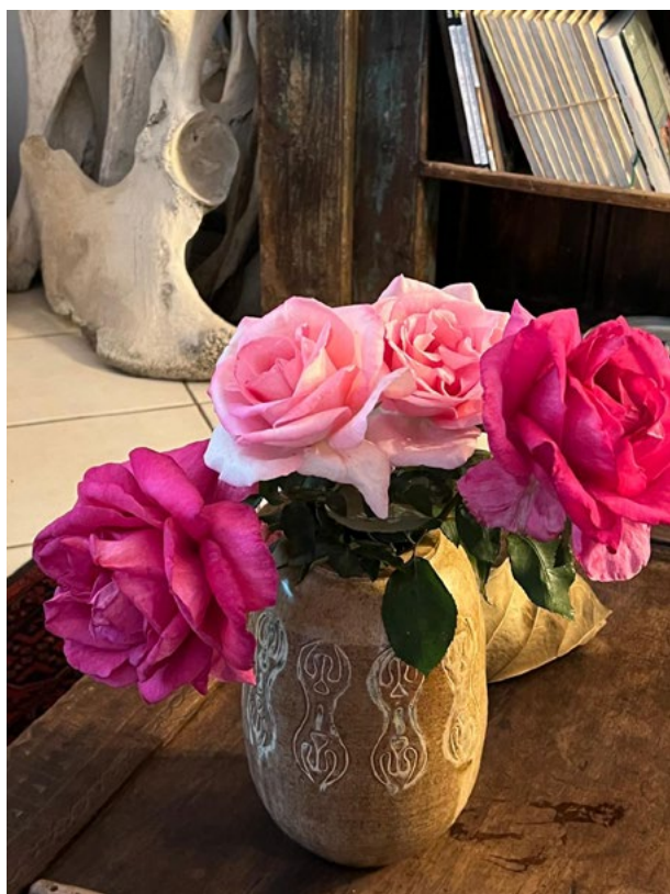
Garden Queen and Garden Princess

Versailles, but in your backyard. Her soft hues and intoxicating scent make her a staple for those romantic nooks — perfect for whispering sweet nothings to your plants.