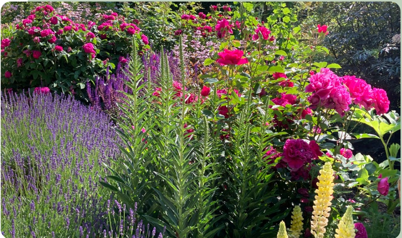
'Bad Bellingem'

Even before that, I will be at the Heritage Conference in Nanyang and Shanghai, where I can enjoy the roses, gardens and the beautiful trees they have along the road, in a great variety. But even more I am looking forward to meet our rose friends again. I hope there will be many present. For those who aren't able to come, we will make pictures, which you can enjoy in our next edition. But perhaps the introduction