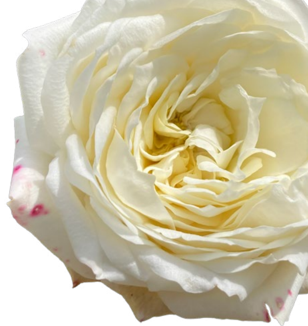
Alaska, Kordes Rosen 2005

WFRS 21st World Rose Convention, Bhopal, India