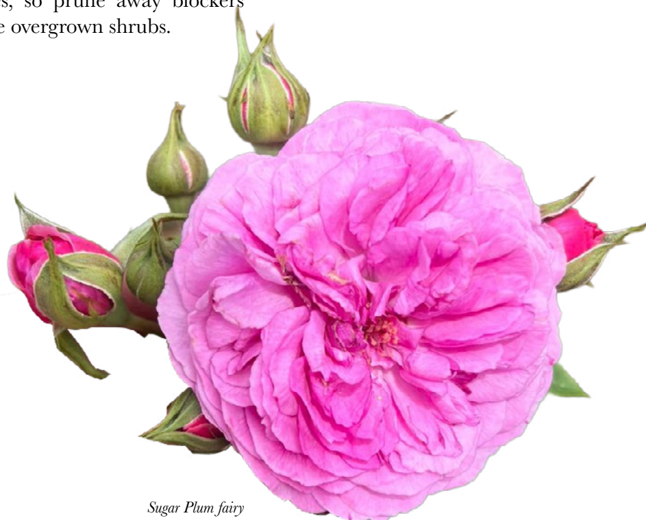
Sugar Plum fairy

Groundcovers matter: I've sworn by Ajuga or Erigeron — they cool the soil without stealing nutrients. Plant small Salvia greggii hybrids a couple of meters away; they're like natural fungus fighters, warding off outbreaks with herbal heroism.