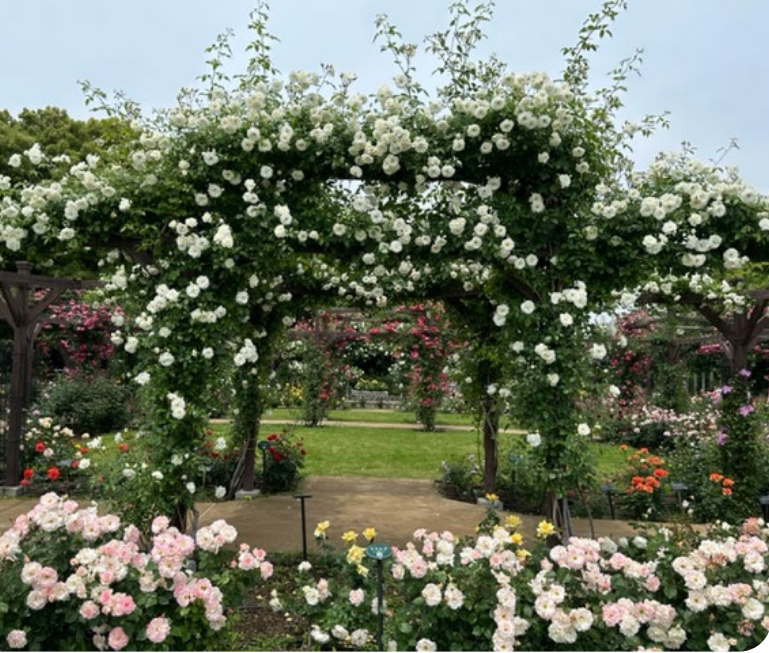
Garden Photo - Second Place - Osaka Botanical Garden

titled “Fun with Photography”. Sounds like fun! You can register on Rose.org member events. There is no charge and non-ARS members are welcome.