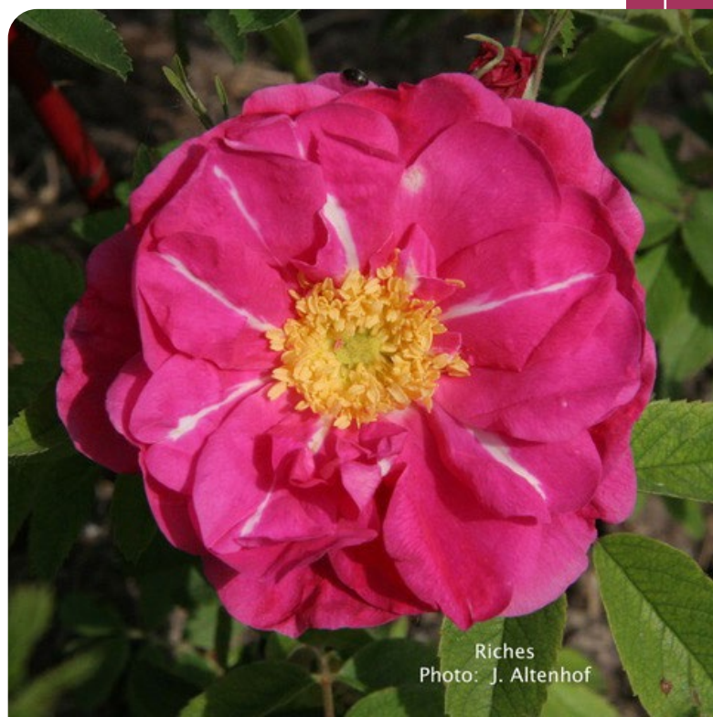
Riches