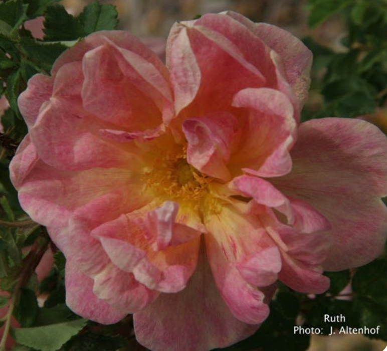
Ruth