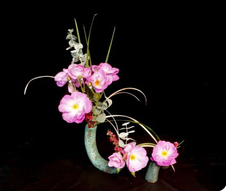
Modern Arrangement Photo 1st Place

2026 events that are currently taking registrations include a Heritage Rose Conference and an ARS National Rose Convention and Rose Show: